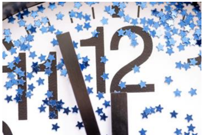
"New Years Eve Party" by Christmashat is licensed under CC-BY-3.0.