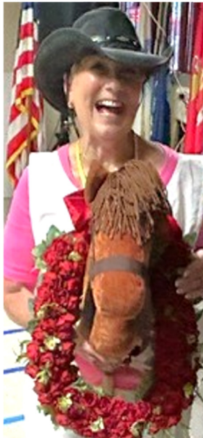
Derby Race Winner!