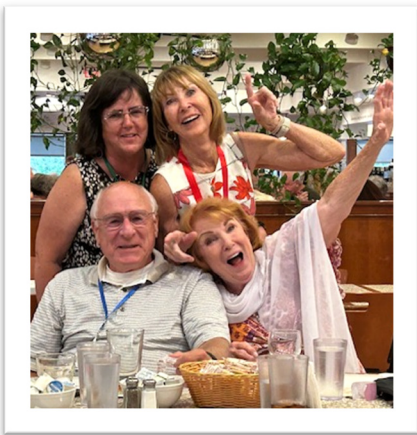
September Fish Fry at Maxim's