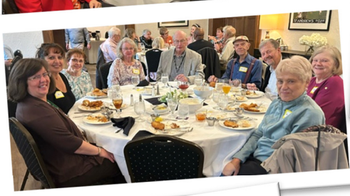
November Social Gathering