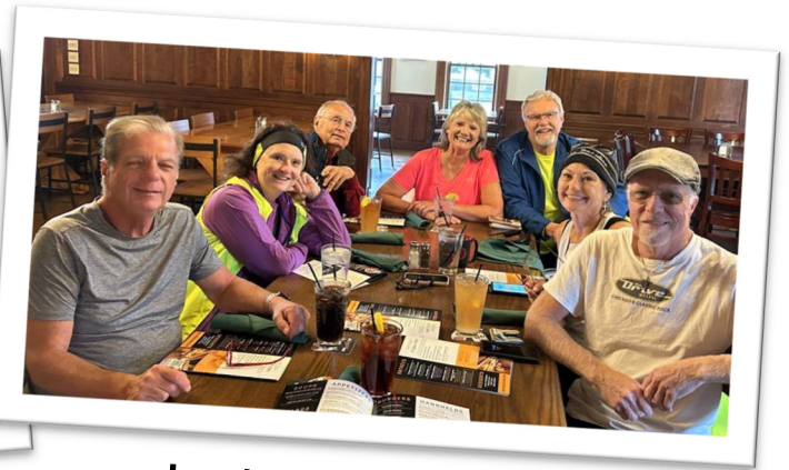
Lunch at Revere's for the last bike ride of the season