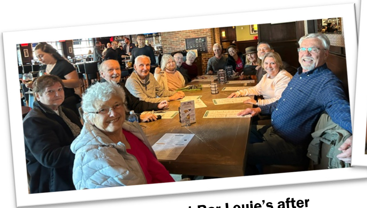
Happy Hour at Bar Louie's after Friday Movie Matinee