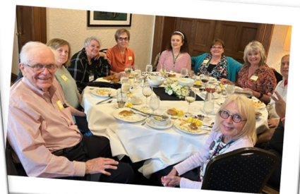
October Fish Fry at North Hills Country Club