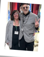
October Pizza Night at the New Berlin Ale House