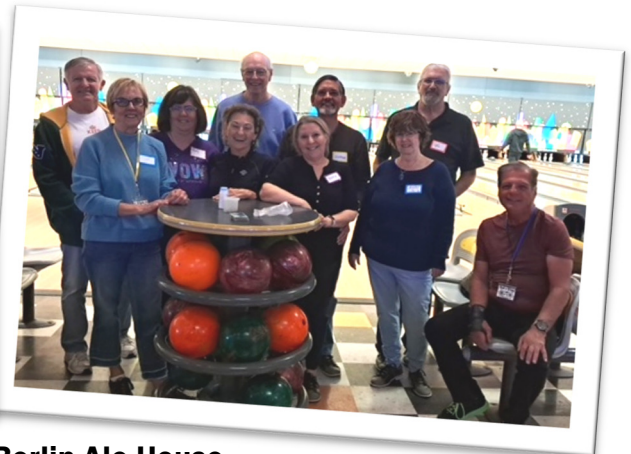
Bowling at the New Berlin Ale House